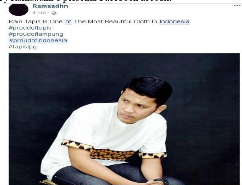
Kain Tapis Is One of The Most Beautiful Cloth In Indonesia #proudoftapis #proudoflampung #proudofindonesia #tapislpg

Facebook post by Ramaadhnn’s personal Facebook account