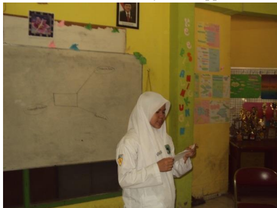
Figure 1. Whilst-reading activity

In post reading, (6) they presented mapping on the white board; (7) the teacher gave feedback; (8) they listened the feedback and responded it. In other words, students were sitting and discussing a loud and others were walking around to share mapping, and they had greatly involved in the three reading stages.